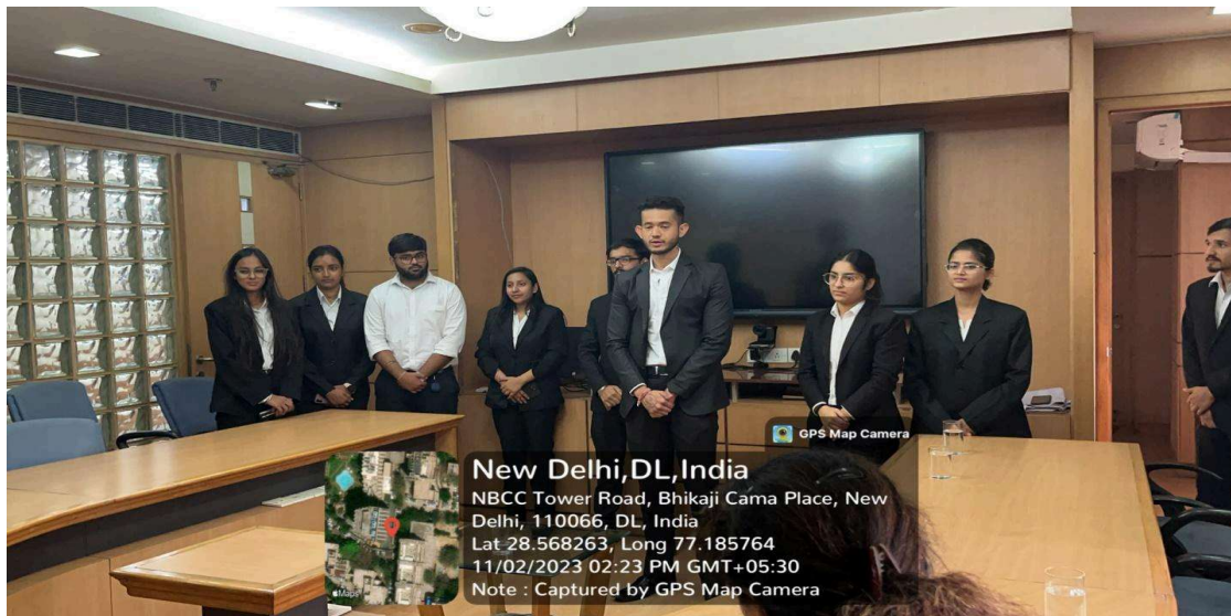
Image1: Law students at Damodar Valley Corporation, performing a play and raising awareness about the impact of corruption.

Report: On November 2nd, Department of Law JIMSEMTC organized a drive at Damodar Valley Corporation with 13 members from the Legal Aid Society. The event featured a play performed by students highlighting the harmful effects of corruption. We began by thanking the attending government officials for the opportunity to collaborate, then performed a skit that portrayed how corruption negatively impacts Mother India, depriving disadvantaged individuals of their rights and opportunities. The skit also highlighted corruption's detrimental effects on economic development by diverting resources from essential public services like healthcare, education, and infrastructure, ultimately hindering growth and perpetuating poverty.