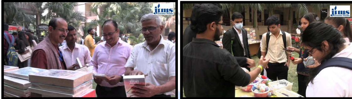
Stalls of different items

In addition to the main competitions, the fest featured a vibrant array of stalls that added to the lively atmosphere of the event. Students and guests enjoyed a variety of treats from fast-food stalls, an ice cream stand, a book stall, and soft drink stations. These stalls allowed attendees to take a break, socialize, and savor the festive spirit of the day.