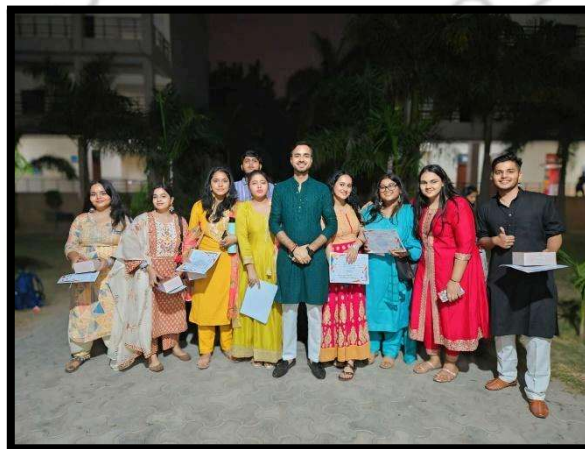
OORJA 2024 TEAM MEMBERS

The Annual Media Fest OORJA 2024 at JIMS Greater Noida was a resounding success, fostering a sense of community, collaboration, and competition among students from various colleges. Through events like Jhankar , Sargam , Ankhe Alfaz , Rangmanch , Ada , and the coveted Mr. and Ms. OORJA , students were able to exhibit their talents and celebrate the essence of media and communication. The fest not only allowed participants to shine but also enriched their skills and gave them valuable exposure to industry professionals.