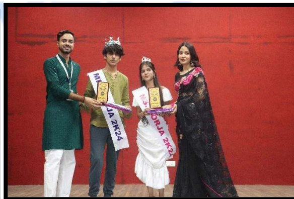
Mr. and Ms. OORJA 2024