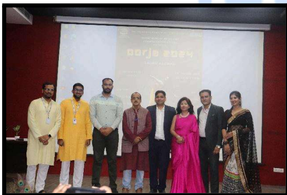
Jury Members with HoD and Staff

Their expertise provided valuable feedback and encouraged participants to continue pursuing their creative passions.