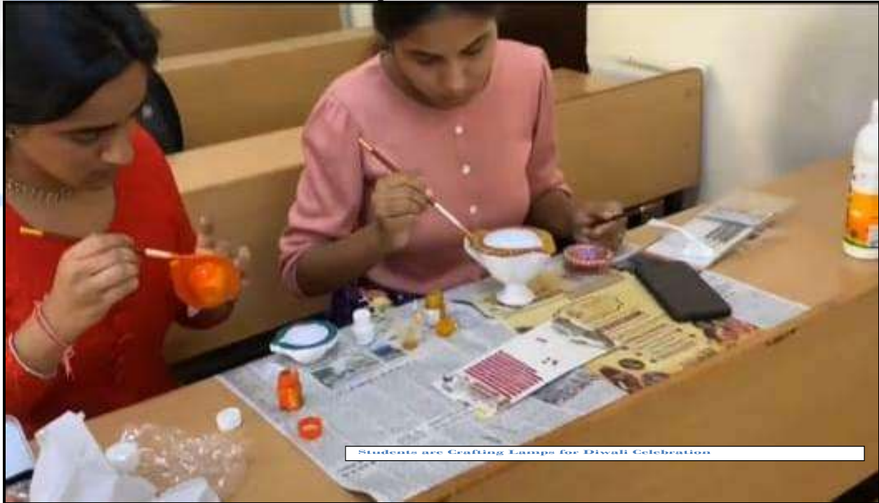
Students are Crafting Lamps for Diwali Celebration