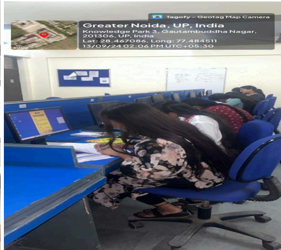
Slogan writing competition